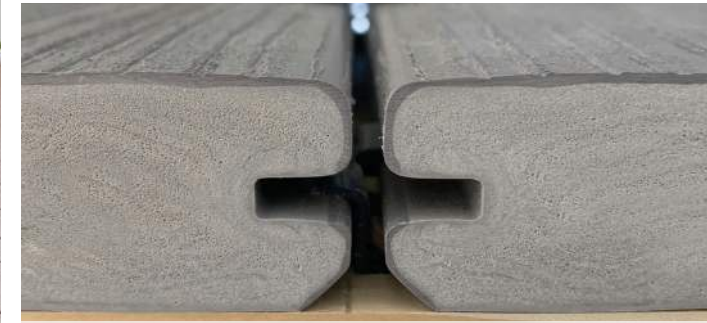
Photo shows an installation using a hidden fastener system. Ask your VEKAdeck representative about recommended hidden fastener systems.